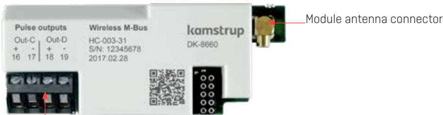
2 x pulse outputs